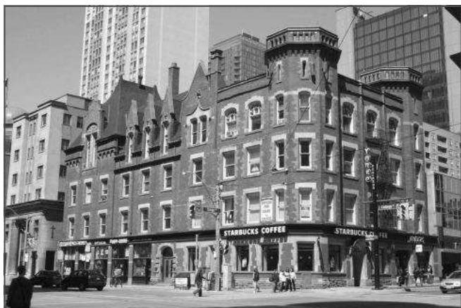
Oddfellows Hall (1891-92 Dick & Wickson)

There are various lodge buildings along College. The Oddfellows Hall still stands at Yonge St. It was built in 1891-92 by Dick & Wickson. Further along, at 491 College, the Freemasons' Hall (1910 Edwards & Saunders) was used by six different lodges who shared the hall. In 1965 it became Latvia House. The façade still stands as part of an LCBO outlet. At 394 Euclid an Orange Hall was built in 1912. In 1998 it was refurbished as the "Movie House Lofts" with retail below.