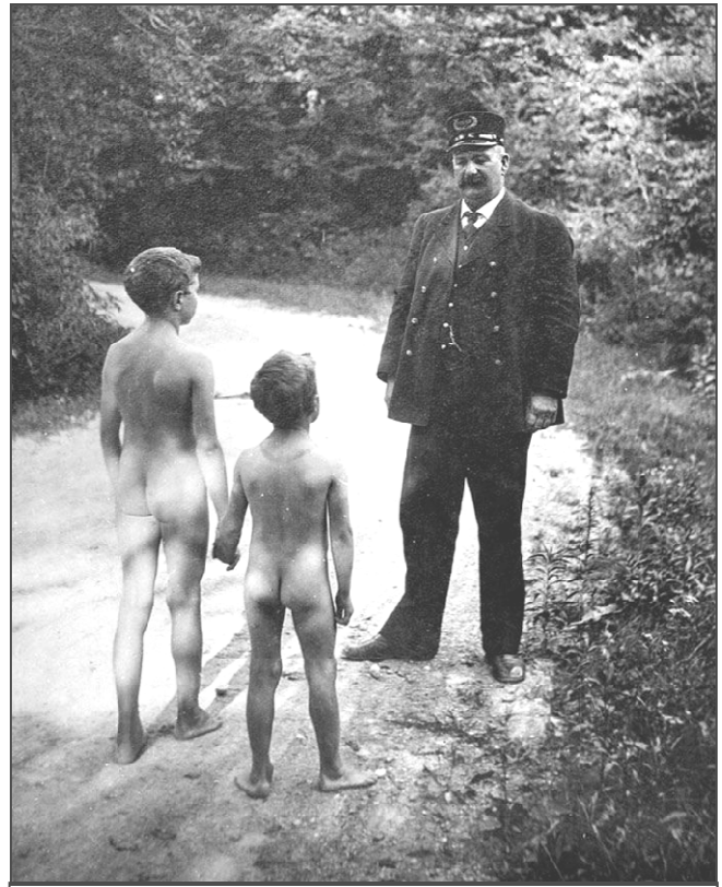
Police officer and boys on road, 1910-1930