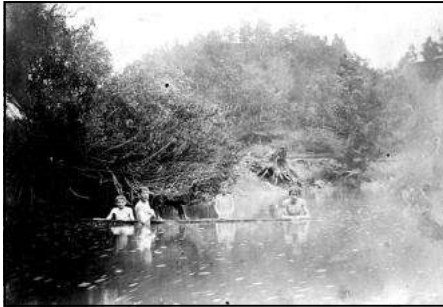
Dunnett's Swimming Hole, West Don R. west of Bayview Ave Bridge, 1900 TPL