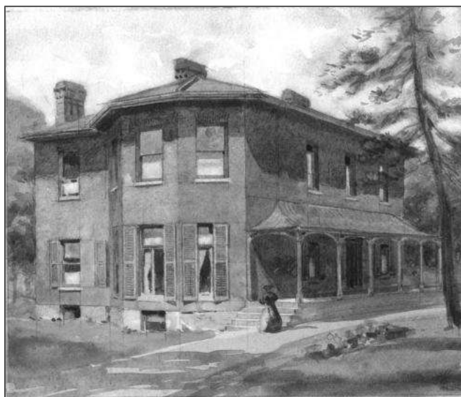
Wykeham Lodge, painted by Owen Staples TPL

At the corner of Yonge and the future College Street stood Wykeham Lodge, the Regency mansion of Sir James Buchanan Macaulay. His estate stretched from Yonge to Bay Street. The house was built in 1844, and sold in 1869 to Bishop Strachan School (BSS). Extended and renovated, it was used until 1915 when BSS moved to Forest Hill. After WW1 it became a convalescent home for veterans. It was demolished in 1928 and replaced by the Eatons College Street store, which is now College Park.